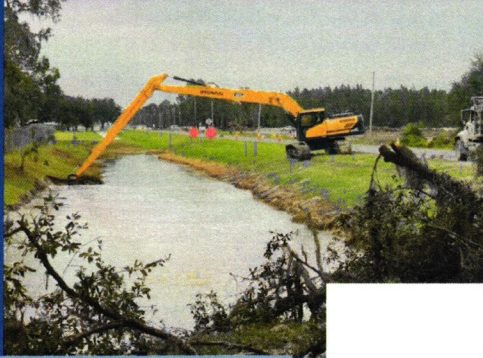
Flood Mitigation- Airport